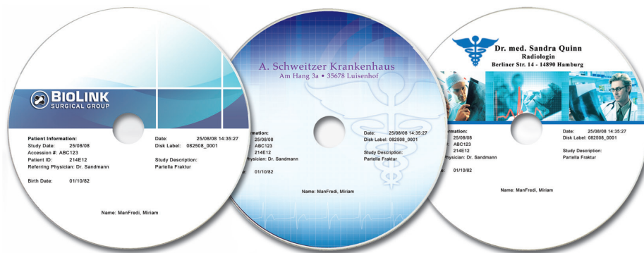
Fig. 2 Examples of patient CDs with individual label designs for doctors or hospitals

Mainzer Str. 131 • 65187 Wiesbaden • Germany Phone: +49 (0)611 92777-0 • Fax: +49 (0)611 92777-50 info@dtm-medical.eu • www.dtm-medical.eu